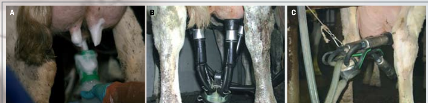
Figure 1. The Milking Routine. A. Washing of teats prior to milking. B. Aligning the milking units. C. Removal of the milking units.

At the point of starting the milking, the operators should observe the state of the cows, i.e. are they kicking, nervous, not tolerating the milking unit, etc? Cows are animals that do speak to us in their own way and one way of expressing themselves is through the behaviour we have just described.