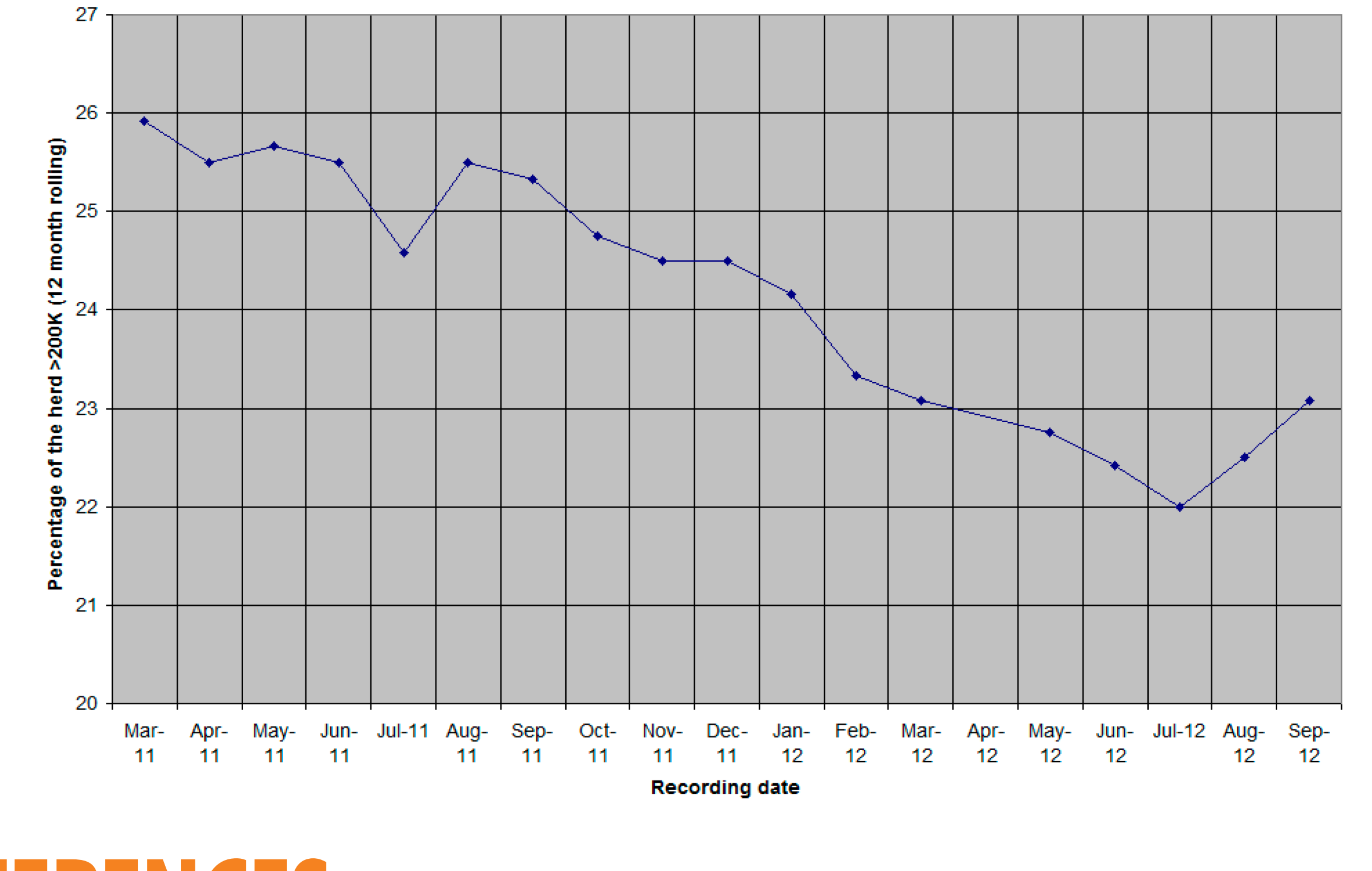
Figure 2. Percentage of the herd with somatic cell count greater than 200,000 cells per ml (12 month rolling mean) from March 2011 to September 2012.

Subsequent to these alterations, the incidence of clinical mastitis remained unacceptably high at between 80 and 90 cases per 100 cows per year and the decision was taken to vaccinate the herd against E.coli , Staphylococcus aureus , coliforms and coagulase-negative Staphylococci (CNS) using a commercially available product (Startvac<sup>®</sup>: Hipra UK Ltd.) The vaccination regime used consisted of an initial course of two doses of vaccine given one month apart followed by a booster dose every three months thereafter.